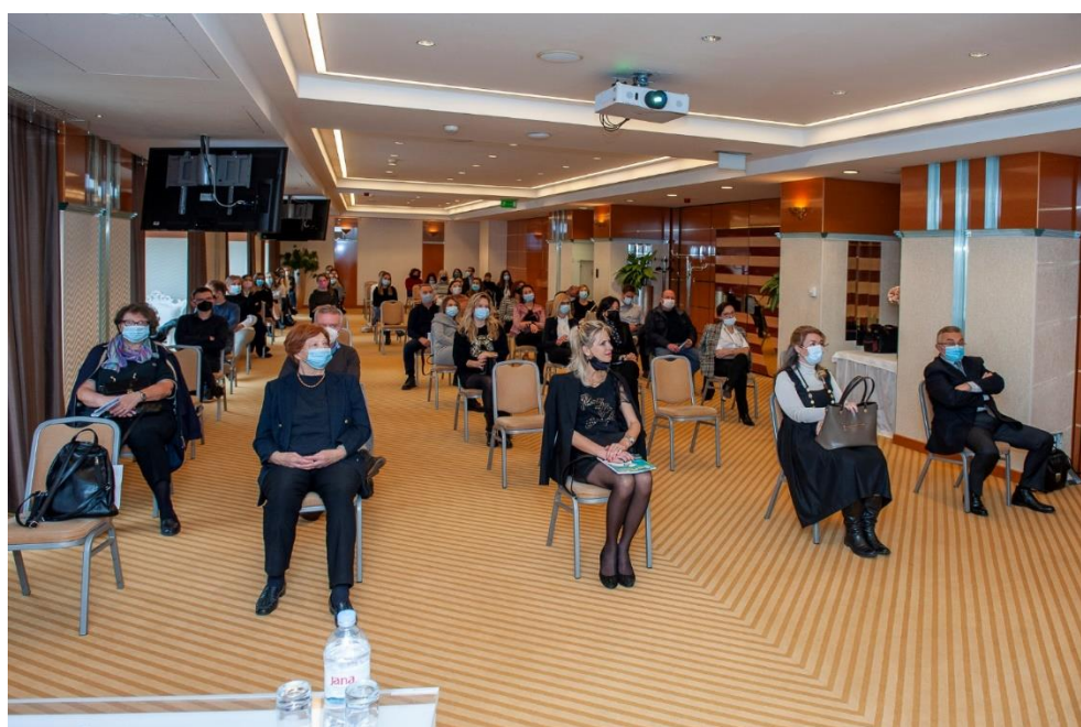
Figure 2 Attendees at the Symposium.